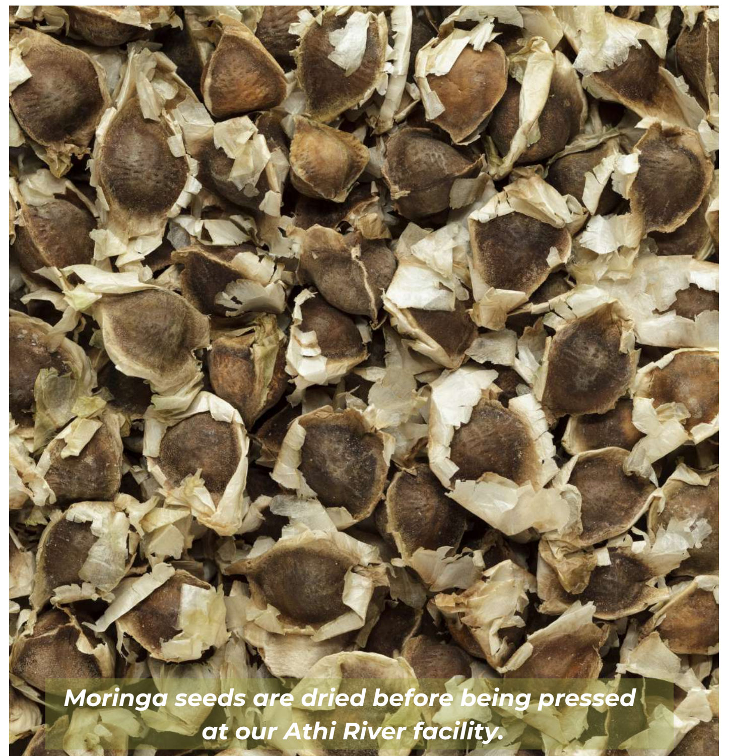
Moringa seeds are dried before being pressed at our Athi River facility.